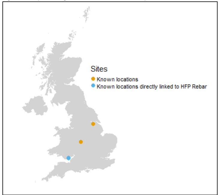
Figure 2: Map showing the UK locations of known producers of HFP Rebar