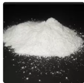
High Quality White Powder YF3 13709-49-4 Yttrium... US$200.00 - US$2... 1 Kilogram (MOQ)