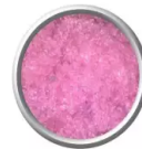
Neodymium Fluoride / NdF3 / CAS No. 13709-42... US$40.00 - US$50... 1 Kilogram (MOQ)

Not exactly what you want? 1 request, multiple quotations Get Quotations Now >>