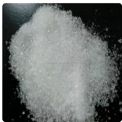
99.9% Min Electron Grade Strontium Carbonate with... US$5.00 - US$8.00 10 Kilograms (MOQ)