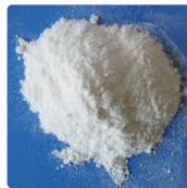
YbF3 High Purity Fine Particle Anhydrous... US$15.00 - US$52... 1 Kilogram (MOQ)