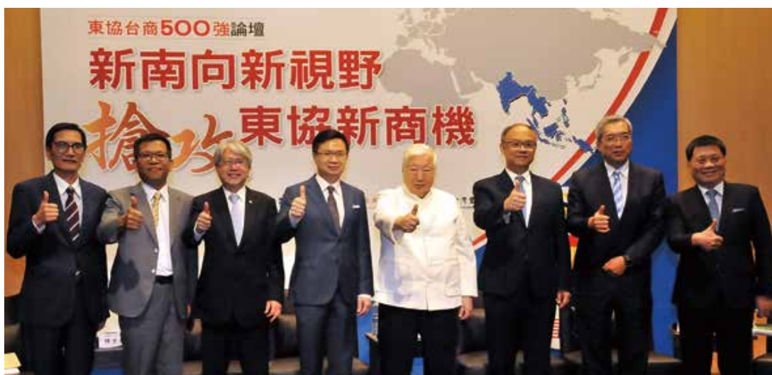
Eximbank cooperated with Ministry of Economic Affairs, TAITRA, and China Credit Information Service Ltd., and held together the forum of "Top 500 of Taiwanese Business in ASEAN-New Vision in New Southbound, Snatching New Business Opportunities in ASEAN", the participants responded enthusiastically. (Photo taken in May, 2018)