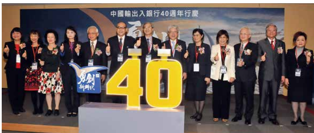
To celebrate the 40th anniversary of its establishment, Eximbank held "Embrace New Era" forum at International Convention Center of Chang Yung-Fa Foundation on January 11, 2019, and competent authorities were invited.

Eximbank established and carried out an annual training program for employees in order to actively train financial professionals and strengthen their financial expertise. Employees were sent to attend meetings hosted by professional financial research training organizations. Eximbank also frequently gave theme-based training courses with recruited scholars and experts as professors. In 2018, Eximbank hosted 24 specialized and regulatory topic speeches along with 16 professional training sessions by various departments, and 16 foreign business trip report-based seminars, totaling 2,273 trainees. It positively enhanced bank employees' professional knowledge to meet business development needs.