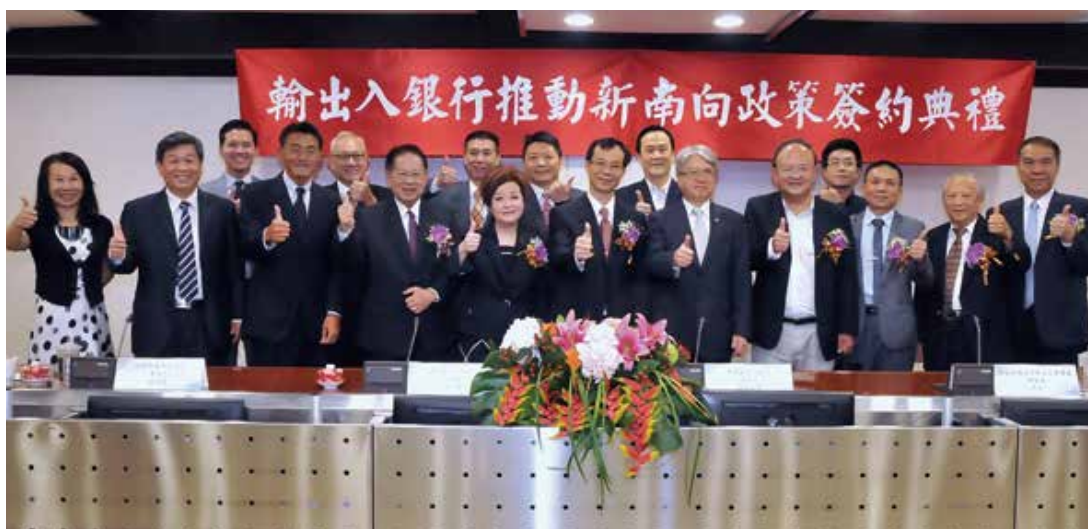
To implement New Southbound Policy, Eximbank held signing ceremony with General Resources Co., Ltd., Chan Chun Construction Co., Ltd., and Ho Sheng Electrical Co., Ltd. to assist the development of new southbound construction market. (Photo taken in July, 2018)

Going forward, Eximbank will keep its commitment to AML/CFT efforts by arranging ongoing employees training programs, updating internal AML/CFT guidelines and procedures on a regular basis and adhering to the latest international best practices, especially those endorsed by the Financial Action Task Force on Money Laundering (FATF), Basel Committee on Banking Supervision, and Wolfsberg Group.