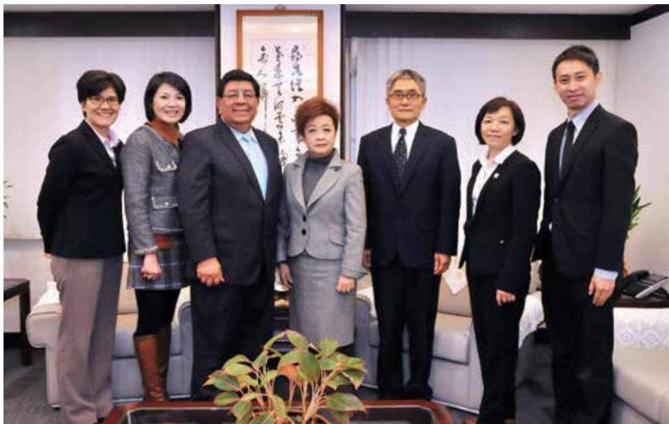
Delegation led by D&B President Asia visited Eximbank to hold in-depth discussion on credit information business.(Photo taken in January, 2019)