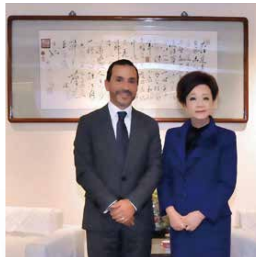
Delegation led by President of the Central Bank of Honduras visited Eximbank to discuss business cooperation.(Photo taken in October, 2018)