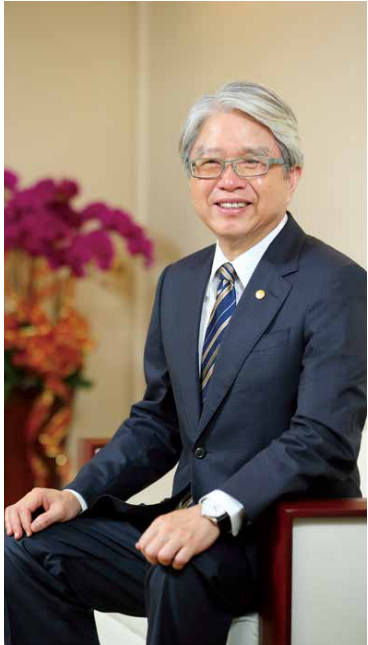
Chairman of the Board of Directors |

In order to assist enterprises in contracting overseas projects, Eximbank has established overseas financing and guarantee business for overseas construction projects since its establishment. When enterprises need financing or guarantee services for undertaking overseas projects, Eximbank may provide immediate financial support to enhance the competitiveness of enterprises in overseas market. Recently, since government reveal the New Southbound Policy and encourage enterprises to actively participate in public construction projects in new southbound countries, Eximbank has not only devoted itself to promote its overseas construction finance and guarantee services, but also endeavored to obtain the National Development Fund's consent