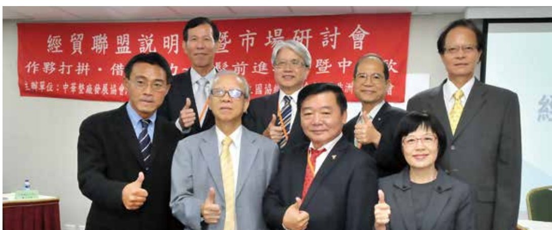
Eximbank founded 'Economic and Trade Union' together with Taiwan Turnkey Project Association, Central, Eastern Europe and CIS Association, and Taiwan-Africa Business Association. ( Photo taken in August, 2018)