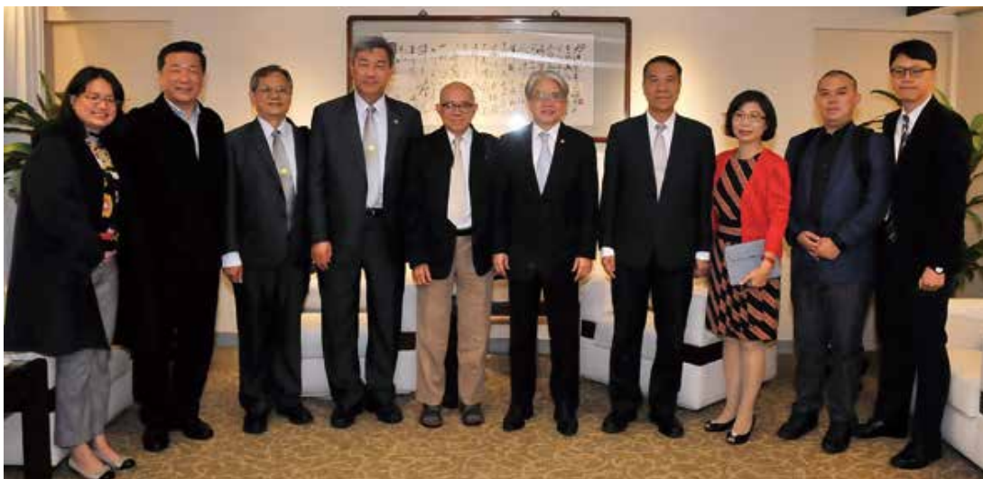
Delegation led by General Director of Taiwan-Myanmar Economic Trading and Culture Exchange Association and Myanmar Trade Office (Taipei) visited Eximbank.(Photo taken in December, 2018)