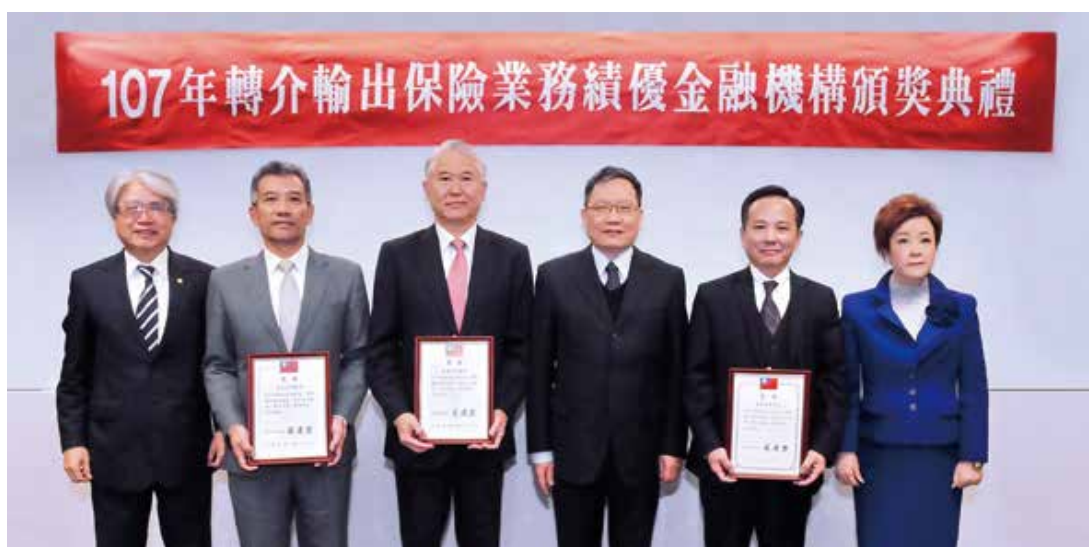
Minister of Finance Jian-Rong Su awarded financial institutions for Excellence in Export Credit Insurance Referral Services in 2018. (Photo taken in February, 2018)

Up until the end of 2018, Eximbank has signed Cooperation Agreements with official export credit agencies of 18 countries globally including Poland, Czech Republic, Hungary, Japan, Slovakia, Turkey, Thailand, Indonesia, Malaysia, Belarus, South Korea, Israel, China, Sweden, Sri Lanka, Hong Kong, India and Finland; and also signed