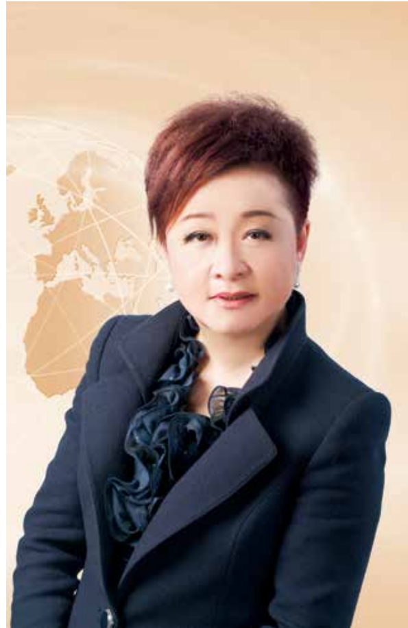
President | Pei-Jean Liu

Eximbank has been timely participating in domestic syndicated loans such as assisting enterprises to import important fuels, etc. to meet the needs of Taiwan's enterprises for steady operation. The government is striving for promoting green energy. Under the consideration of ensuring stable power supply and environmental protection, the use of gas to replace coal has become a trend. To promote government's energy policy and support Taiwan's development of green energy industry, Eximbank participated in a domestic syndicated loan of a power company and assisted enterprise import important fuel natural gas to support the stable operation of its power plant and enhance its operational competitiveness, through which assisted implementing the Executive Yuan's "Stable Power Supply, improving Air Pollution" policy blueprint and the power supply safety of Taiwan.