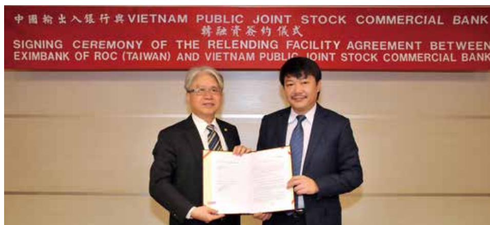
Eximbank signed Relending Facility Agreement with the Vietnam Public Joint Stock Commercial Bank to jointly provide financial support and promote bilateral trade opportunities. (Photo taken in October, 2018)