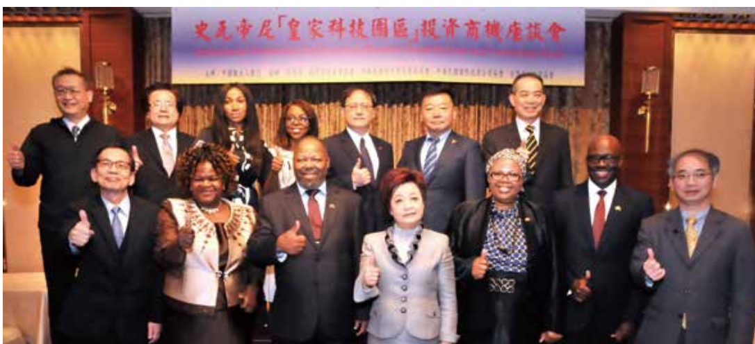
Eximbank held "Investment Promotion Conference on Eswatini Royal Science and Technology Park" in February 2019, and invited persons from enterprises and delegates from the Kingdom of Eswatini, the atmosphere was enthusiastic. (Photo taken in February, 2019)

Eximbank estimates possible impairment on loans and receivables every month and determines whether the items shall be recognized as loss mainly based on observable evidence of possible impairment. The evidence may include observable data indicating adverse