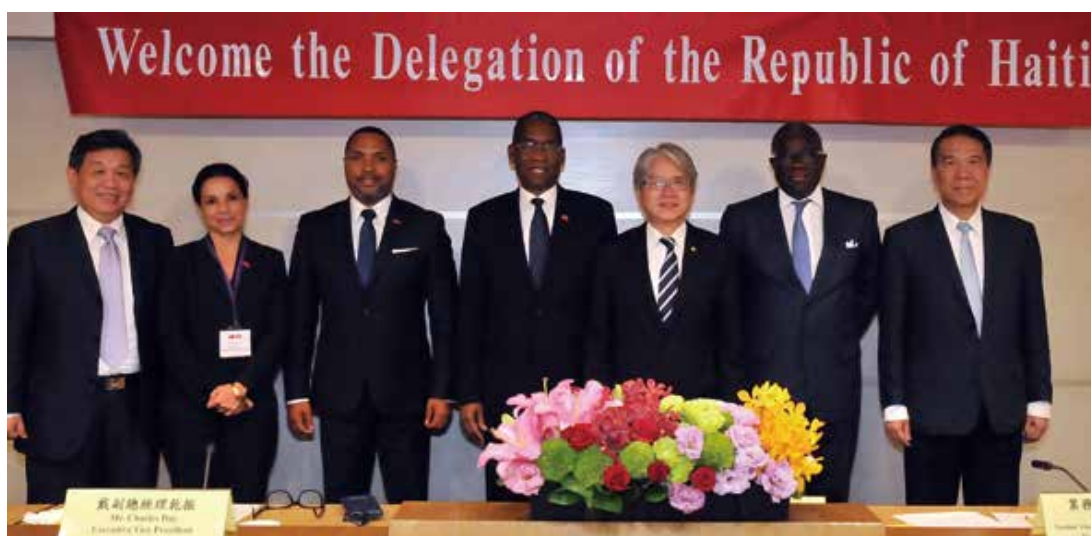
Delegation of Haiti led by Minister of Foreign Affairs visited Eximbank to promote economic and trade cooperation between Haiti and Taiwan.(Photo taken in April, 2018)

The income tax payable (receivable) shall be calculated in accordance with provisions of tax laws and regulations announced by the government, except that the transactions or items directly recognized as other comprehensive profits and losses or as equity directly, and the relevant current income tax shall be recognized in other comprehensive profits or losses or as equity directly, the others shall be recognized as income or expense and included in the current profits and losses.