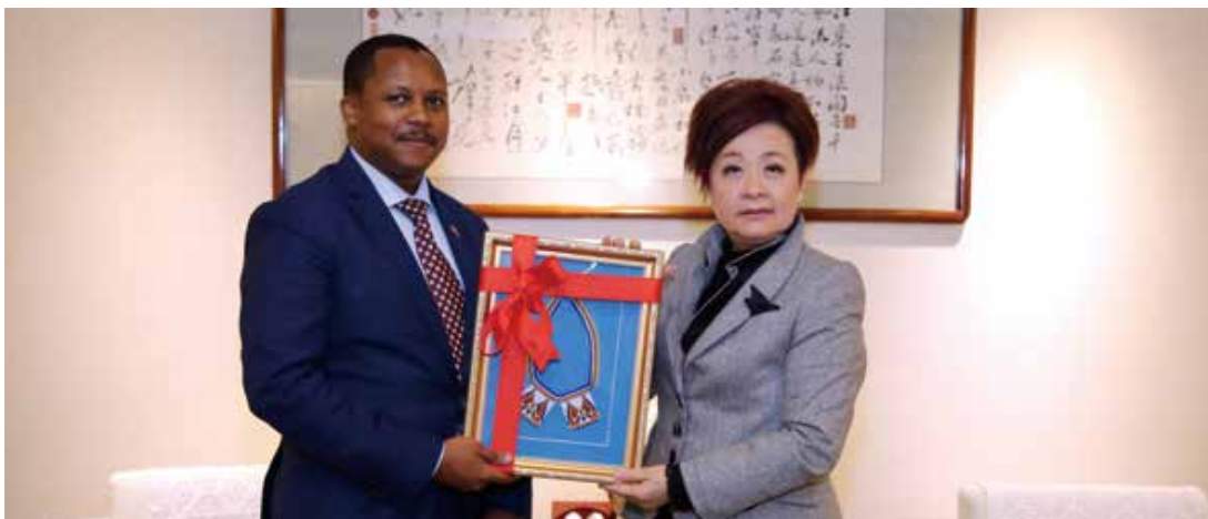
Ambassador THAMIE DLAMINI of Kingdom of Eswatini visited Eximbank to negotiate business cooperation and promote bilateral communication. (Photo taken in October, 2018)

In accordance with the "Preferential Deposit Reform Plan for the State-owned Banks of the Ministry of Finance" approved by the Letter No. 10700283051 of the Executive Yuan on June 29, 2018, the implementation