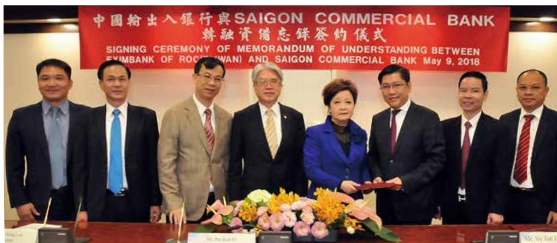
To promote trade development and implement New Southbound Policy, Eximbank signed MOU with the Saigon Commercial Bank to enhance business cooperation. (Photo taken in May, 2018)

Eximbank's intangible assets are all computer software recognized at cost. Amortization of intangible assets is calculated using the straight-line method over the economic service life, with a maximum estimated service life of five years. Subsequent measurements are based on the cost model Eximbank applies. Residual value, amortization periods and amortization methods are reviewed at the end of the reporting period, and any changes in estimates will be applied prospectively.