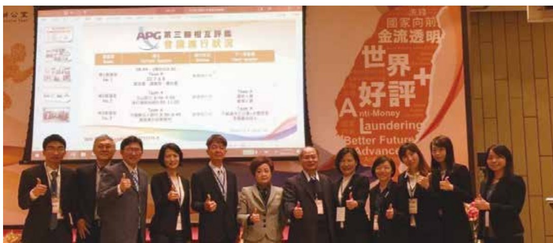
The delegation of Eximbank led by President Jean Liu to attend the APG's Mutual Evaluation. (Photo taken in November, 2018)

(b) If the credit risk of the financial asset has increased significantly since the initial recognition, the allowance for the financial asset shall be measured against the expected credit loss